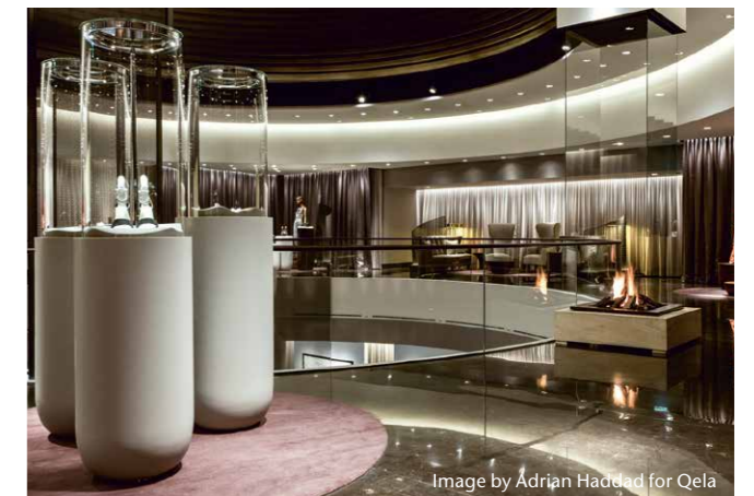
Product presentation: Qela Store, Qatar