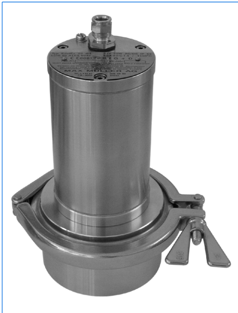
Sightglass light fitting, type EdelEx STERI-LINE 20 dH, 24 V, 20 W, Ex d IIC T4 Gb, Ex t IIIC T130°C Db IP67, Ex II 2 G + D, on metal fused sightglass, DN 100