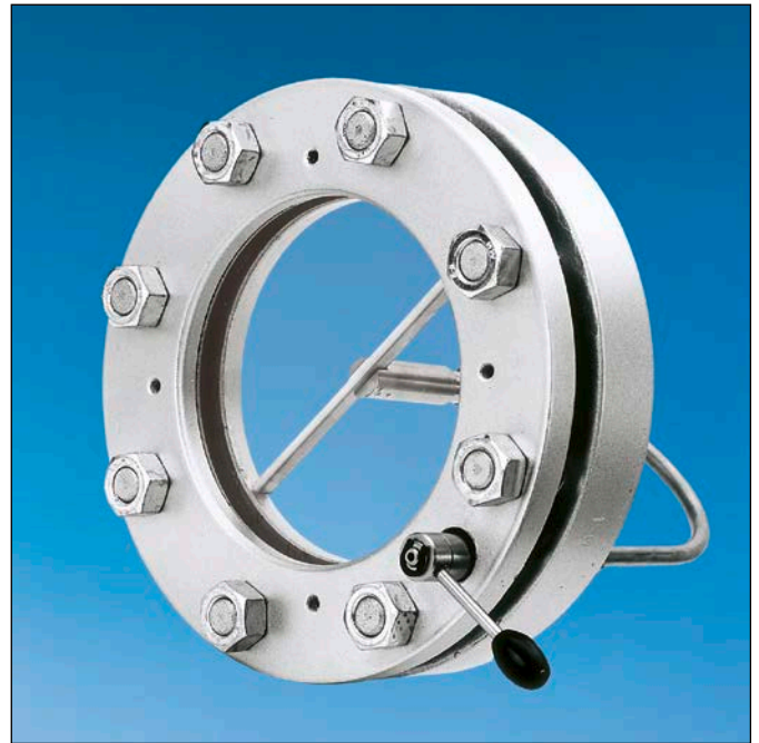
Lumiglas SW II BW mounted into sight glass fitting DIN 28120

Wiper blade: PTFE or silicone rubber All product contact parts are of stainless steel. Mechanical drive internal seal: PTFE