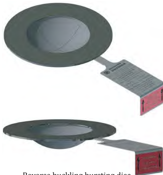
Reverse buckling bursting disc, Type UX (cross-scored)

*Inconel and Hastelloy are registered trademarks of