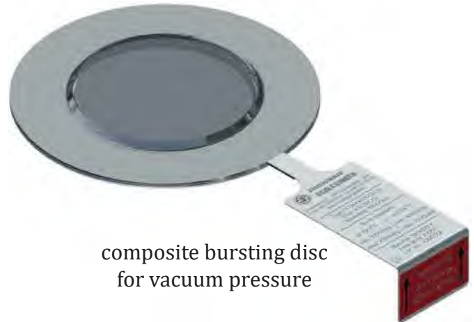
composite bursting disc for vacuum pressure

We use state-of-the-art lasers to cut special rated break points with high precision into foils of stainless steel, nickel, nickel-based materials (Inconel, Hastelloy)* or tantalum, making it possible to adjust the bursting pressure precisely to our customers' specifications. A sealing diaphragm made of PTFE or PFA is positioned precisely between the slotted metal foils.