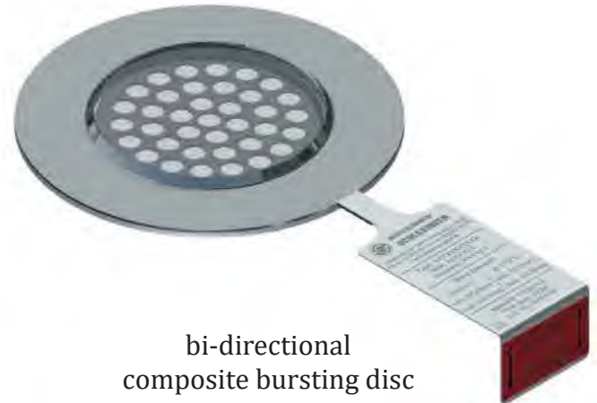
bi-directional composite bursting disc

Since they open fragment free, they can easily be installed in front of a safety valve. In addition, we can provide our composite bursting discs with burst detection.