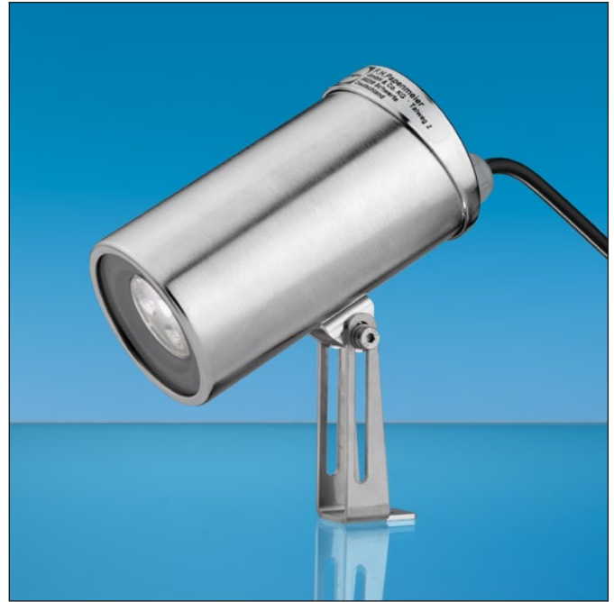
Lumistar luminaire USL 15-LED with hinged bracket