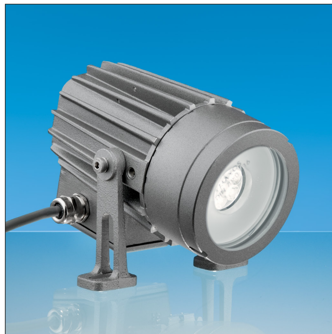
Lumistar luminaire USL 07-LED with terminal box