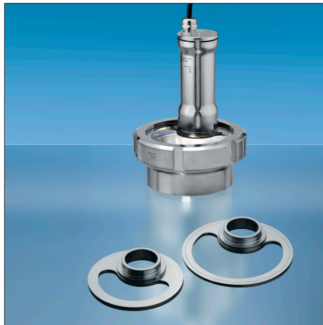
Lumistar luminaire ESL 53-LED-B mounting on a screw-type sight glass fitting according to DIN 11851 or similar

This luminaire is designed for continuous operations. As an alternative, however, it can also be supplied with a switch or pushbutton (see chart).