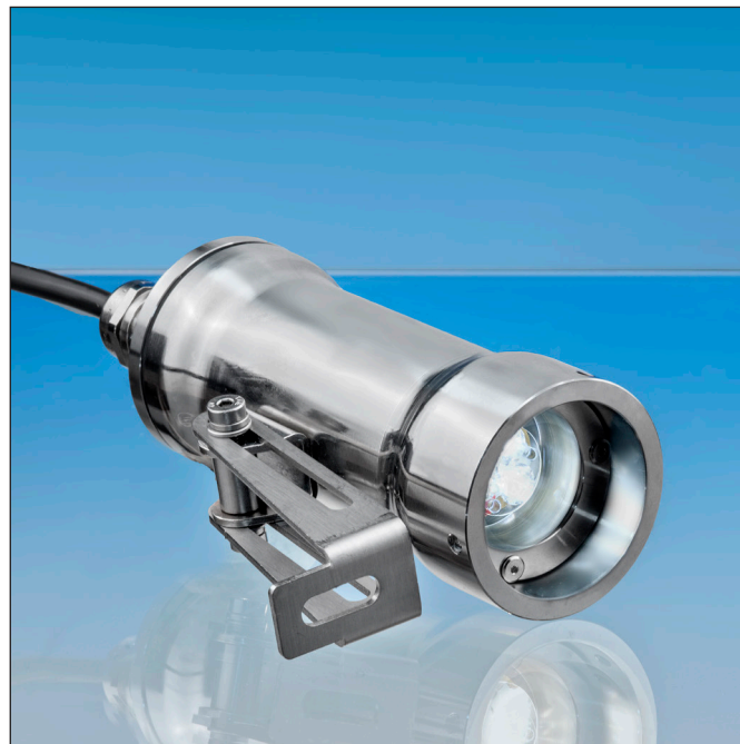
Lumistar luminaire ESL 53-LED-KS with hinged bracket