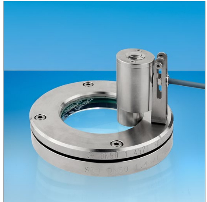
Lumistar luminaire ESL 51-LED-KS adapted to a standard flange