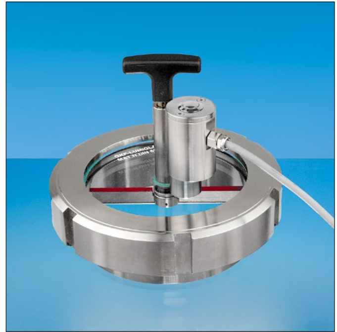
Lumistar luminaire ESL 51-LED-HK installed on a screwed sight glass fitting equipped with Lumiglas wiper unit SW I