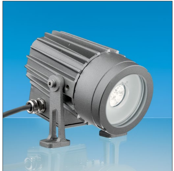
Lumistar luminaire USL 07 LED-Ex with terminal box