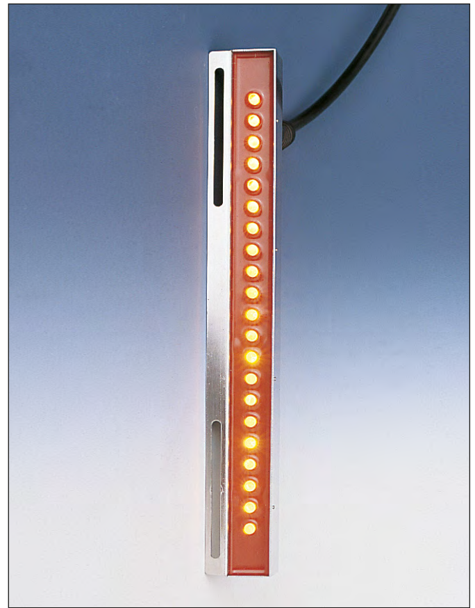
Lumistar luminaire REL 01, luminary side

The luminaire is optimally designed for use with a 250 mm long rectangular sight glass unit. Additional Lumistar luminaires REL 01 can be installed if the fittings are longer.