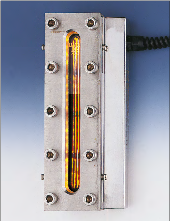
Front view of rectangular sight glass unit, length 250 mm, with side-mounted Lumistar luminaire REL 01 in stainless steel