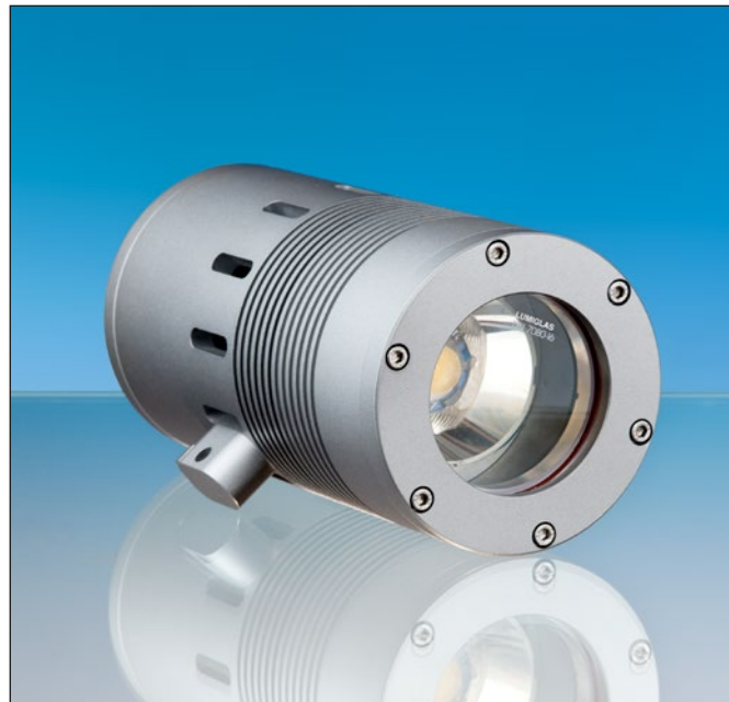
Lumistar luminaire ASL57LED-Ex