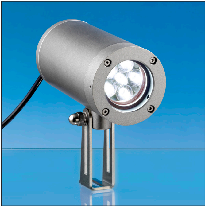
Lumistar luminaire ASL55LED-Ex

24 V AC/DC LED – 11 W/15 W 120-230 V AC/DC LED – 11 W/15 W Protected by 1A miniature fuse Equipped with 4 or 7 high-power LED