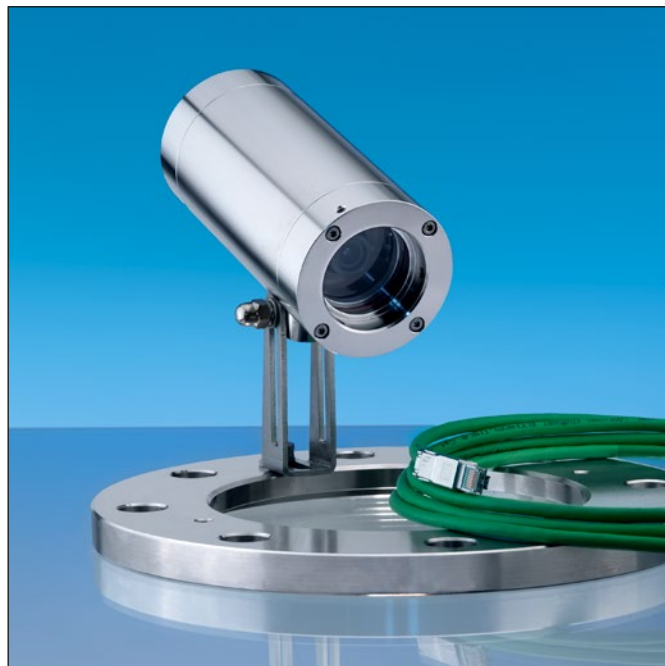
VISULEX camera K55-HD-Ex mounted on a flange with a hinged bracket