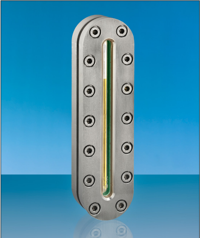
Complete assembly of a Lumiglas oblong oval sight glass fitting